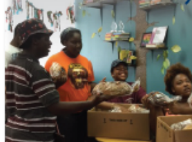
Marietta YELLS youth help pass out bags of produce at one of our mobile food distributions this summer.

CFR is now a Kroger Community Rewards recipient!